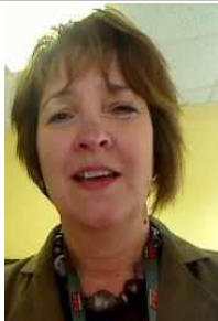
Patient advice and Liaison Service (PALS) Telephone ☎ 0800 02 82 037 Text Phone ☎ 01803 654742 e-mail: pals.sdhc@nhs.net