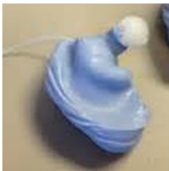
Impression of ear