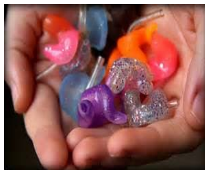
Examples of finished ear moulds