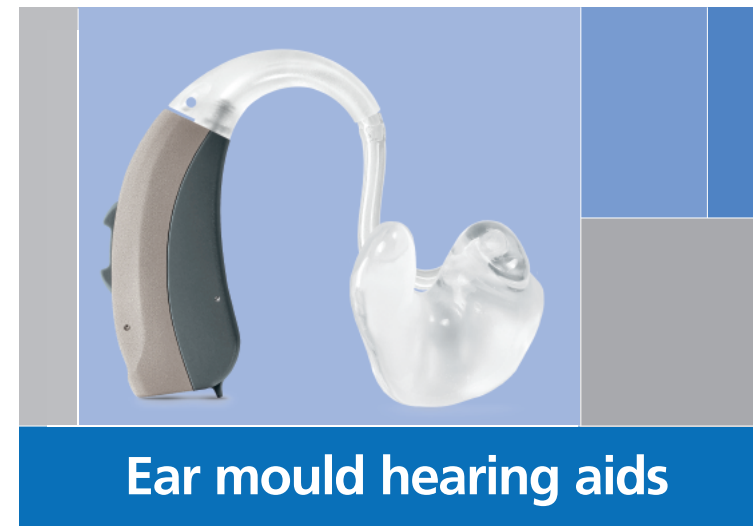
Ear mould hearing aids