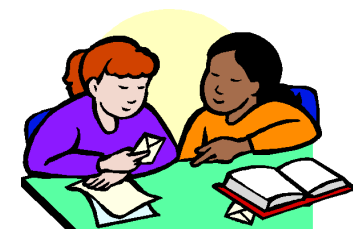
Carer support and onward referral