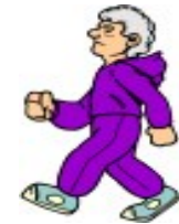
Getting out and about