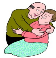
Intimacy & Sex