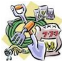
Work and Hobbies