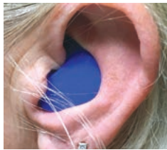
This picture shows how well the plugs fit into your ears.

We can facilitate custom swim plugs to be made in order to provide better protection for those prone to ear infections or other ear problems.