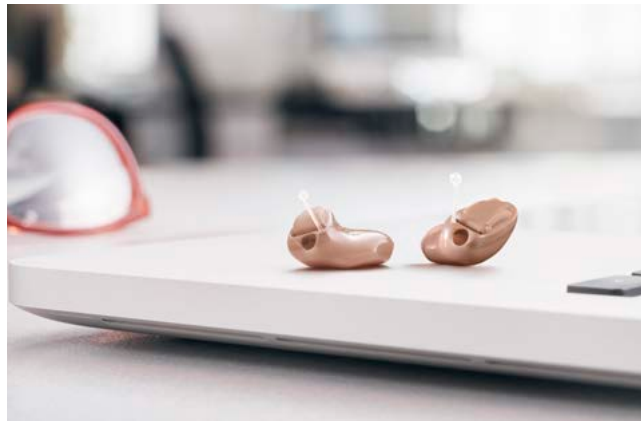
In the ear hearing aids can be as small as your fingertip.

You will be seen by a qualified Audiologist who is also a registered Hearing Aid Dispenser. Our Audiologists have a wealth of experience and will assess your hearing needs to a high standard—you can trust our Audiologists to advise you only of products that would be suitable for you whilst allowing you to choose your preferred option.