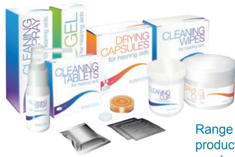
Range of cleaning products available to purchase separately (helps maintain aids).

During your initial appointment your Audiologist will discuss your requirements and advise you on the various styles of hearing aid and accessories available. This will enable you to choose your preferred option—with the help of expert guidance.