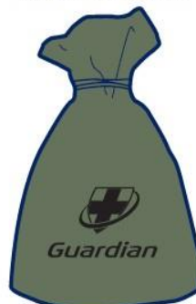
Green Guardian Bag