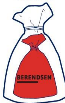
Inner - Dissolvable Red Bag Outer - White Berendsen Bag