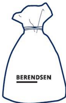
White Berendsen Bag