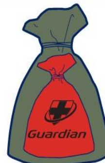
Inner - Dissolvable Red Bag Outer - Green Guardian Bag

This bagging policy immediately supersedes all previous linen bagging policies in adherence with DoH document CFPP01:04