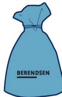
Blue Berendsen Bag