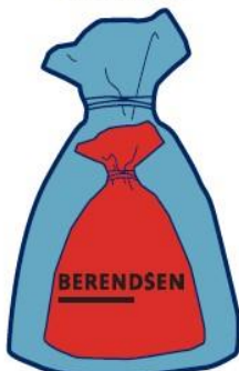
Inner - Dissolvable Red Bag Outer - Blue Berendsen Bag