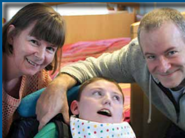
The Caiels Family

If you or your cared for are interested in finding out more about the service, please contact us on (01626) 325 800, where you can self-refer.