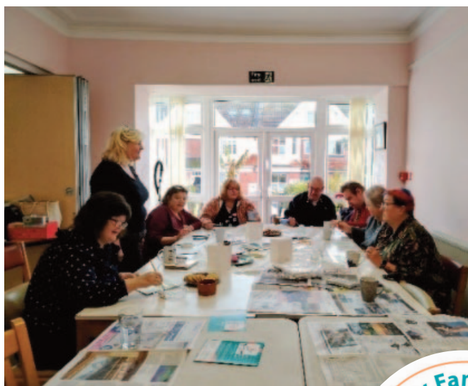
Pictured: Some Carers at the craft session in February

Torbay Family Carers of adults with learning disabilities offers support to Carers of adults with a learning disability in Torbay.